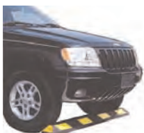
EZDRIVE PARKIT SPEEDBUMP SPIKE